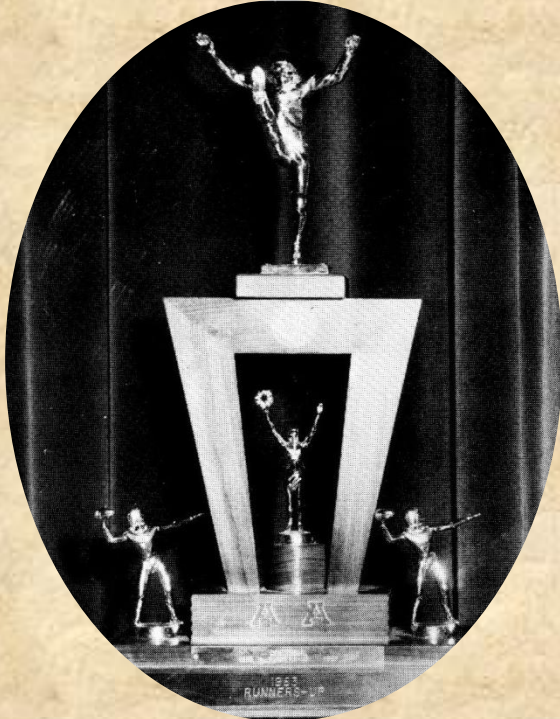
AA Runner-Up Trophy

“To exit, hit the “X” on your browser’s tab for this page.”