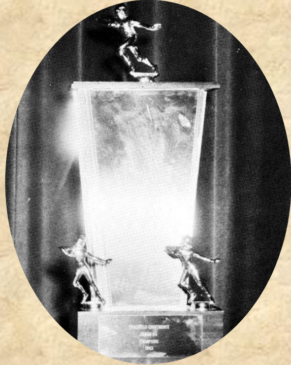
Coalfield Conference Trophy